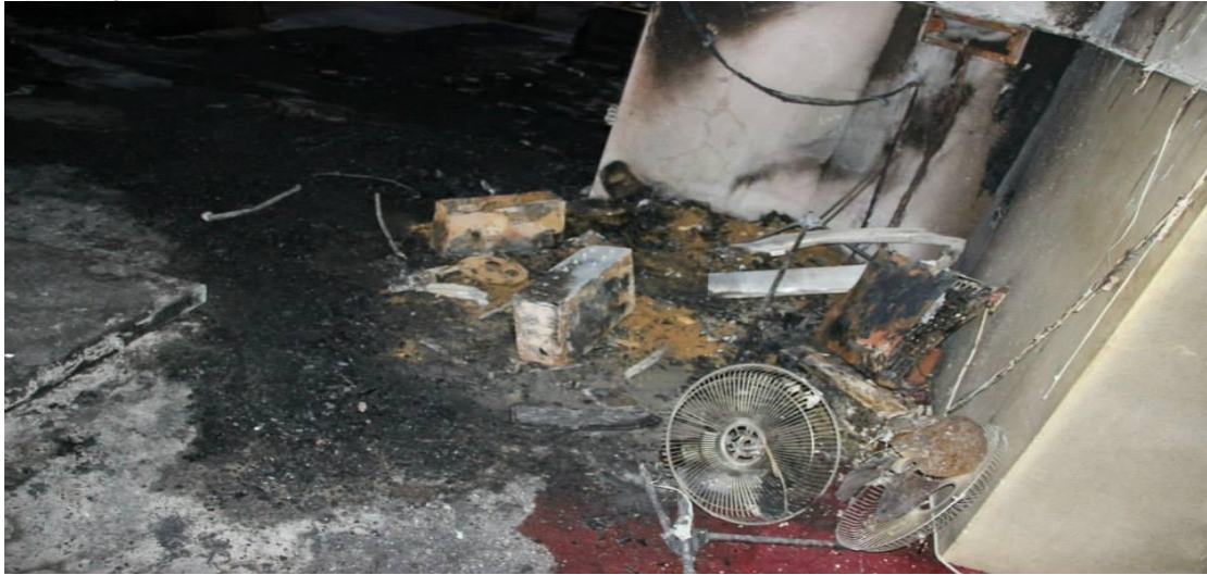
Church of Virgin Mary – Minya

مركز أدرال للتحمل والتسامح ومكافحة العنف Andalus Institute for Tolerance and Anti-Violence Studies