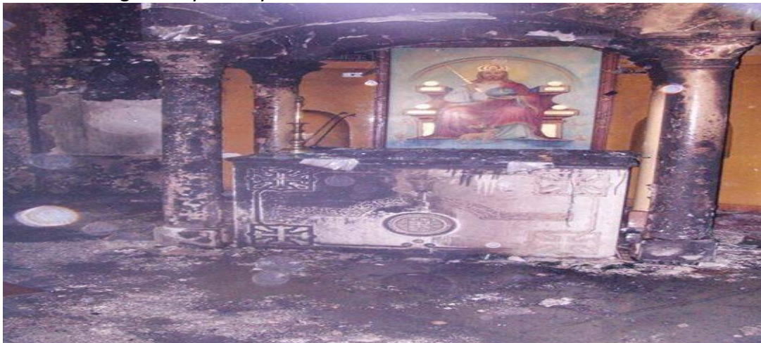
St George Coptic Orthodox Church - Assiut