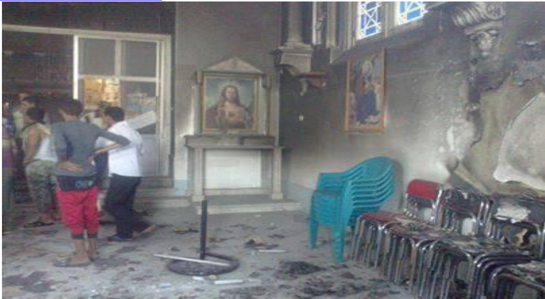
Greek Orthodox Church – Suez