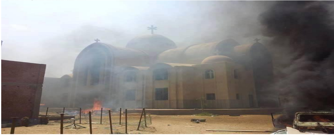
St Mary Church – fayoum

مركز أدراس للتحليل ومكافحة العنف Andalus Institute for Tolerance and Anti-Violence Studies