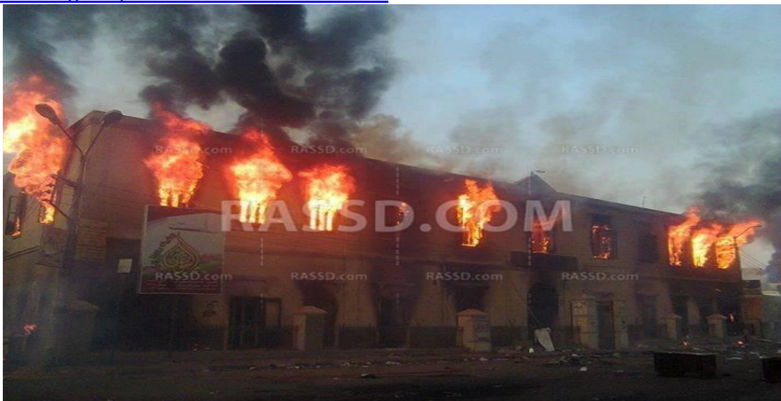
Archeological Nuns School – Beni Seuf